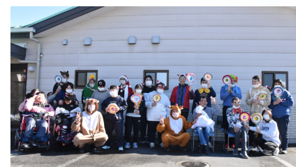
Christmas visit to a welfare facility