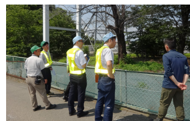
Environmental risk patrols around our factories

Sawafuji works hard to deepen ties with the local community. Our efforts include get-togethers with people in welfare facilities, environmental risk patrols around our factories, as well as volunteer activities and participation in local events.